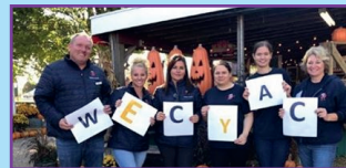
"Together For The Kids" Thiessen Apple Orchard