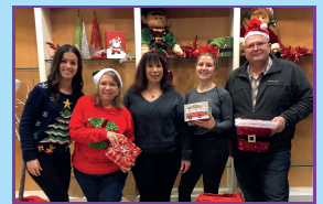
Gift Wrapping Tecumseh Mall