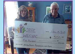
"Together For The Kids" Allsop Farms Pumpkins & More