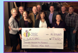
Harvest Mixer Walkerville Eatery