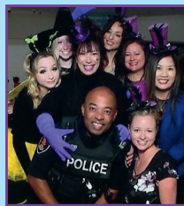
Trick Or Treat Event Tecumseh Mall